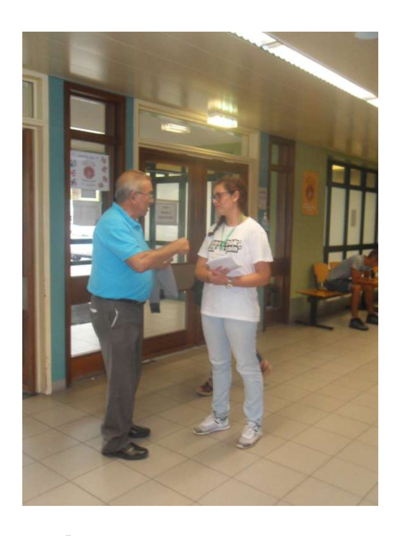
3 – The 6<sup>Th</sup> October, an interview during 20 min at the regional TV, RTP Açores (Program « Açores Hoje »);