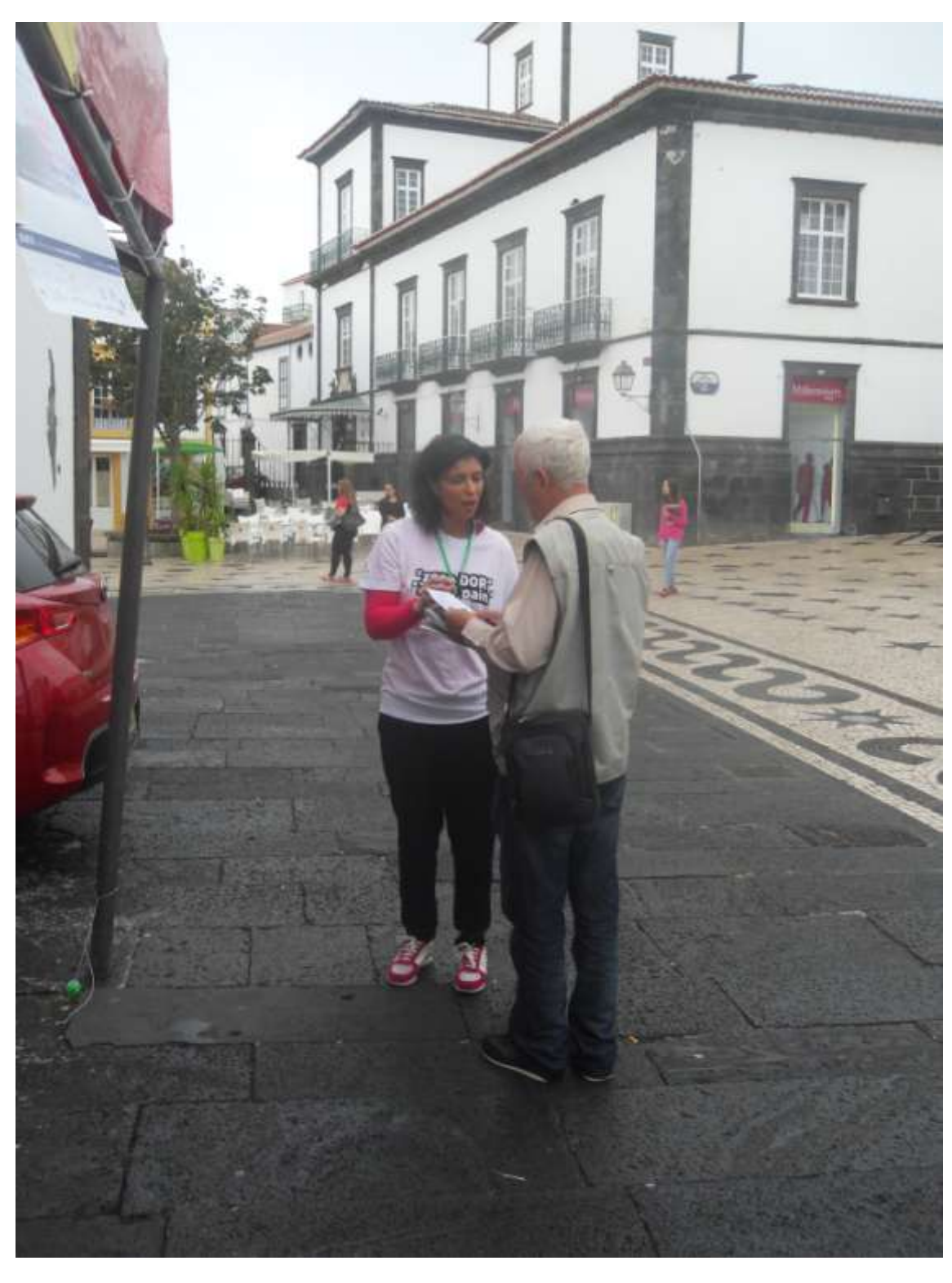
– The 7 th October an interview to the news in local TV, \mbox{\bf RTP} \mbox{\bf Acores}.